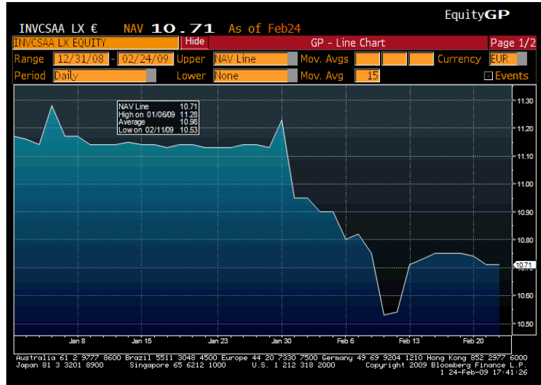
Data as at 24 February 2009.

A Shares, data as at 24 February 2009, unless otherwise stated.